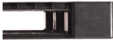
"Double thickness" deck board