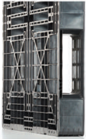
Strong bottom skid structure